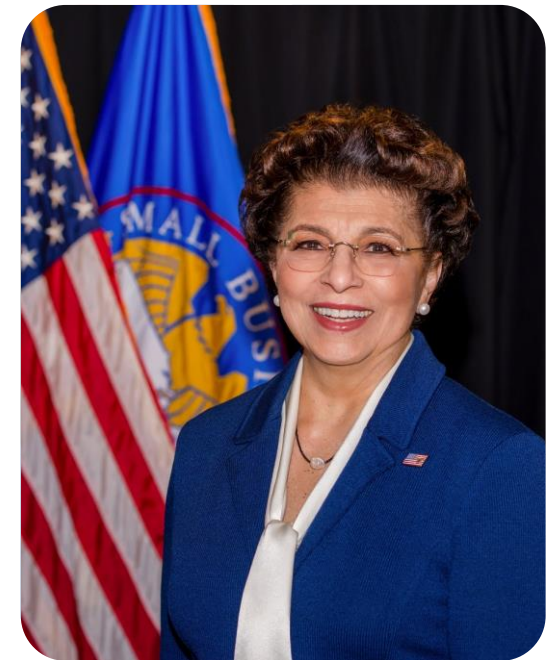
Administrator Jovita Carranza

Upon a request received from a state's or territory's Governor, SBA will issue under its own authority, as provide by the Coronavirus Preparedness and Response Supplement Appropriations Act that was recently signed by the President, an Economic Injury Disaster Loan declaration.